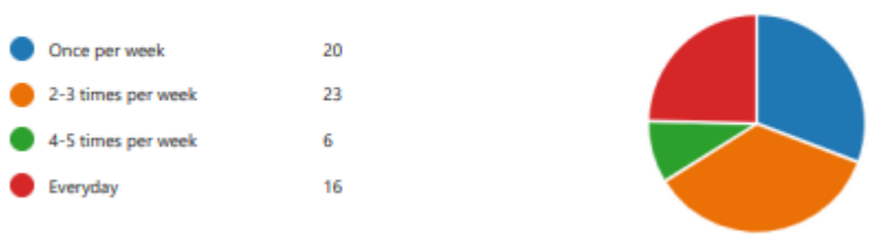
17. I hear my child read (0 point)

We are trying to raise our standards constantly, especially in basic skills reading. I would urge parents to try and hear children read at least 3 times a week, I do understand that time is sometimes difficult to find but research does show children who read regularly get a rapid start! As a staff we have undertaken training in phonics this year , we assess your child’s reading every half term, there is now a section on assessing fluency of reading rather than just reading the RWI words. Fluency only improves the more we read, reading the same book with increased confidence is an important part of learning to read.